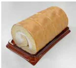
CREAM ROLL CAKE