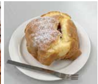
BOMB CASTELLA STRAWBERRY