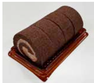
CHOCOLATE ROLL CAKE