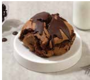
BOMB CASTELLA CHOCOLATE