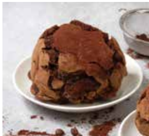
BOMB CASTELLA TIRAMISU