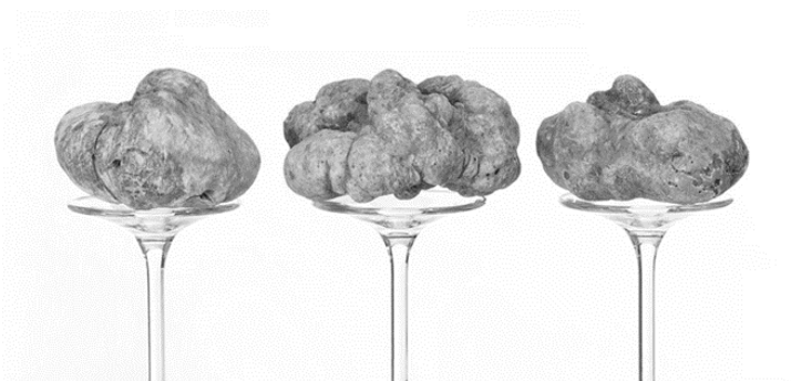
SECRET OF BEAUTY