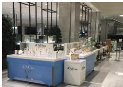
HYUNDAI DEPARTMENT STORE PANGYO BRANCH