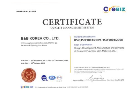
ISO 9001 / 14001

Monthly Producing CAPA 6million EA The time of acquiring CGMP 2015 Researchers 20%