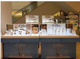
HYUNDAI DEPARTMENT STORE D-CUBE BRANCH