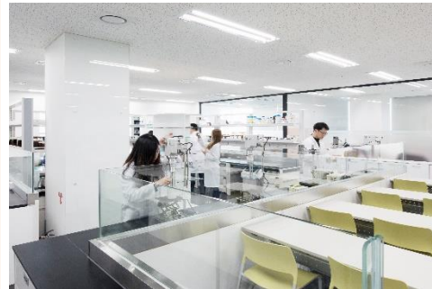
Factory and R&D Center