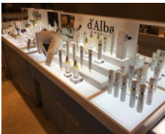
HYUNDAI DEPARTMENT STORE APGUJEONG BRANCH