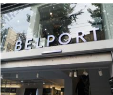
BELPORT BEAUTY (A.G.B)