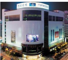
GALLERIA DEPARTMENT STORE DAEJEON BRANCH