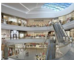
SHINSEGAE DEPARTEMENT STORE HANAM BRANCH