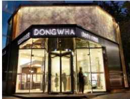
DONGWHA DUTYFREE SHOP