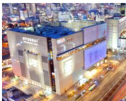
HYUNDAI DEPARTMENT STORE DAEGU BRANCH