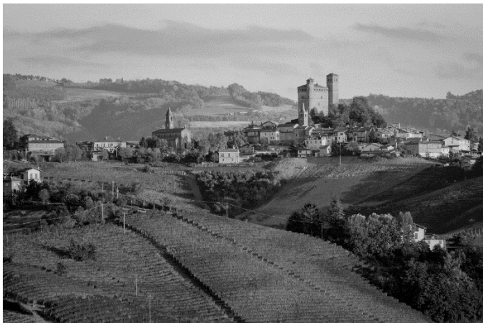
ITALY, PIEDMONT, D'ALBA