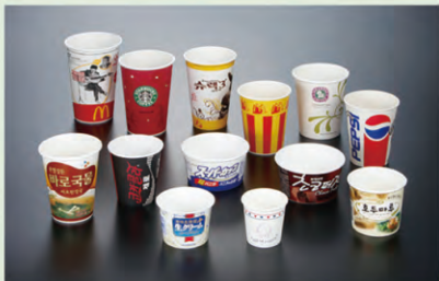
Sleeve Cup Making Machine Hi-Master 1500 SM/RB